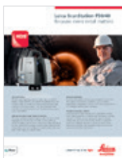
Leica ScanStation P30/40

Illustrations, descriptions and technical specifications are not binding. All rights reserved. Printed in Switzerland – Copyright Leica Geosystems AG, Heerbrugg, Switzerland 2015. 835467en-us – 03.15 – INT