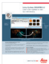
Leica Cyclone REGISTER